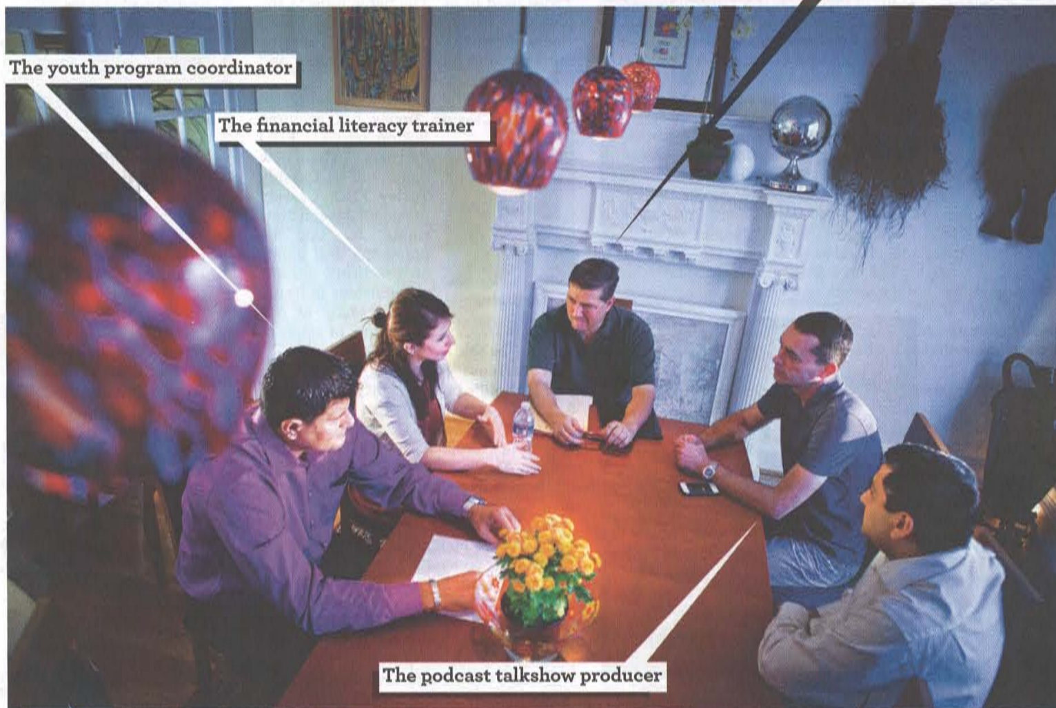
The real estate agent and attorney